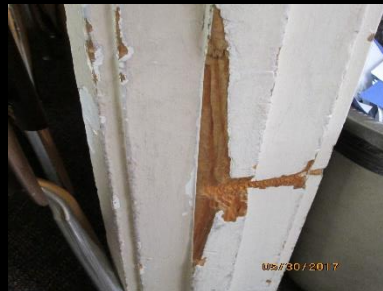
▪ Wood doors and frames