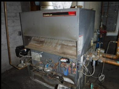
▪ Pool equipment