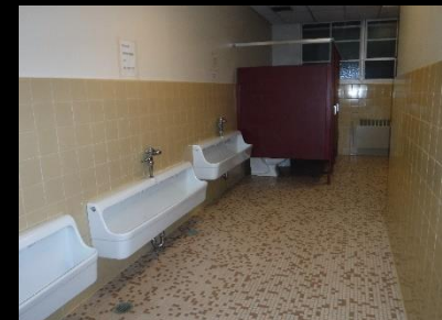
▪ Restroom renovations