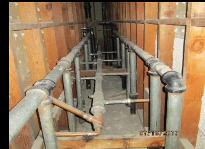
▪ Galvanized piping