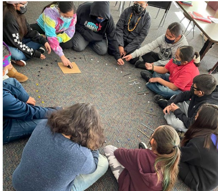
Photos, left: A student learning the Navajo (Diné) language learns about feelings while playing a card matching game. Right: Students learning the Navajo language and culture play the Navajo Stick Game. (Submitted photos)