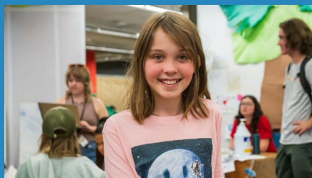
Camp IWANNAGO concludes successful summer... Page 4