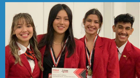
CHS Interior Design Team compete in Denver... Page 6