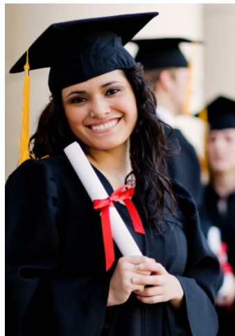
College & Career Ready

For updates on the PARCC Assessment see our November Newsletter